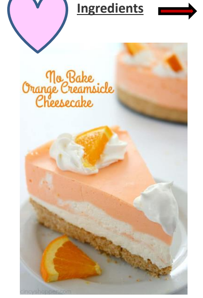
Happy Valentine's Day